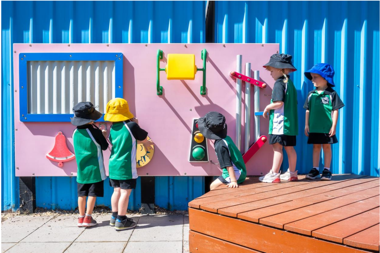
Term One - Week 6